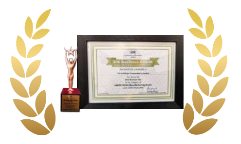
CII SHE Excellence Award